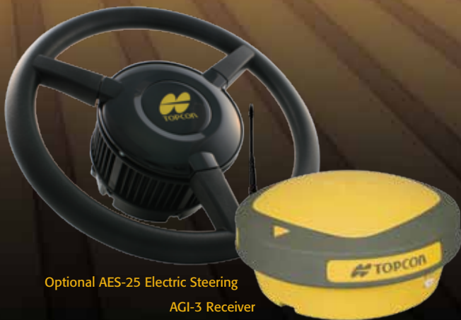
Optional AES-25 Electric Steering AGI-3 Receiver